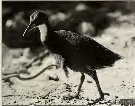
White-throated Rail Dryolimnas cuvieri aldabranus, Aldabra